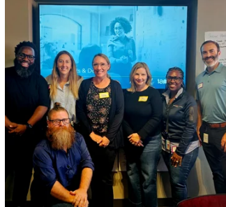
Capital One Pro Bono Marathon