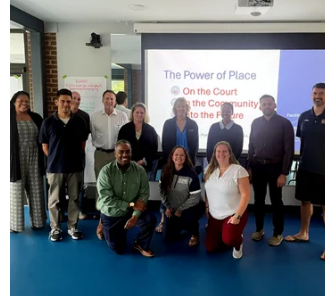
RVC Board Strategic Planning