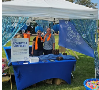
Festival of Inclusion, Duck Race Edition